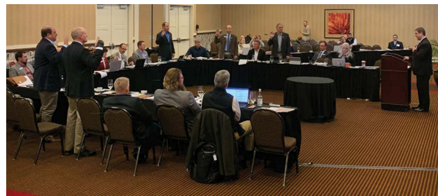
Five Kansans are on the Sorghum Checkoff Board of Directors working to increase producer productivity and profitability: